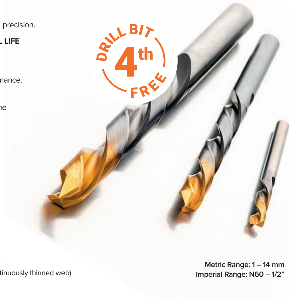
Metric Range: 1 – 14 mm Imperial Range: N60 – 1/2"